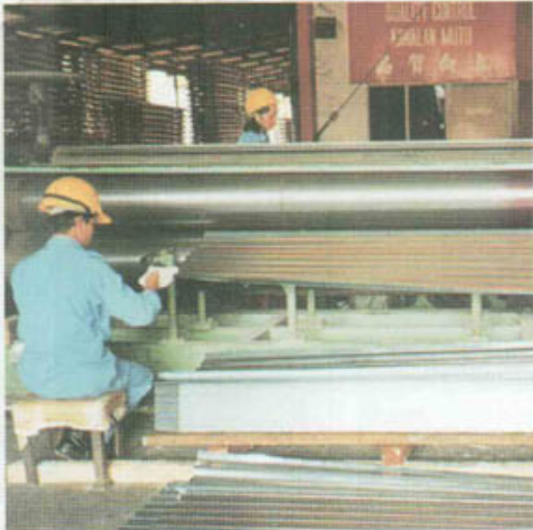
Corrugated Sheets Production