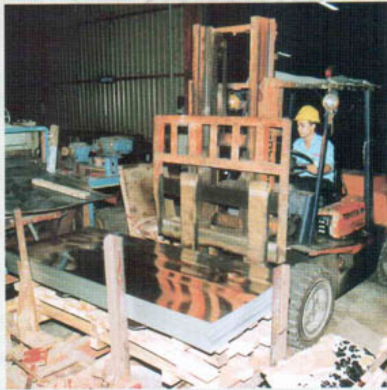
GI Flat Sheets

These traditional metal roofing sheets are produced to JIS standard G3316 as shown by following illustration. Various lengths can be produced up to 3,658 mm (12feet) by using barrel corrugated method.